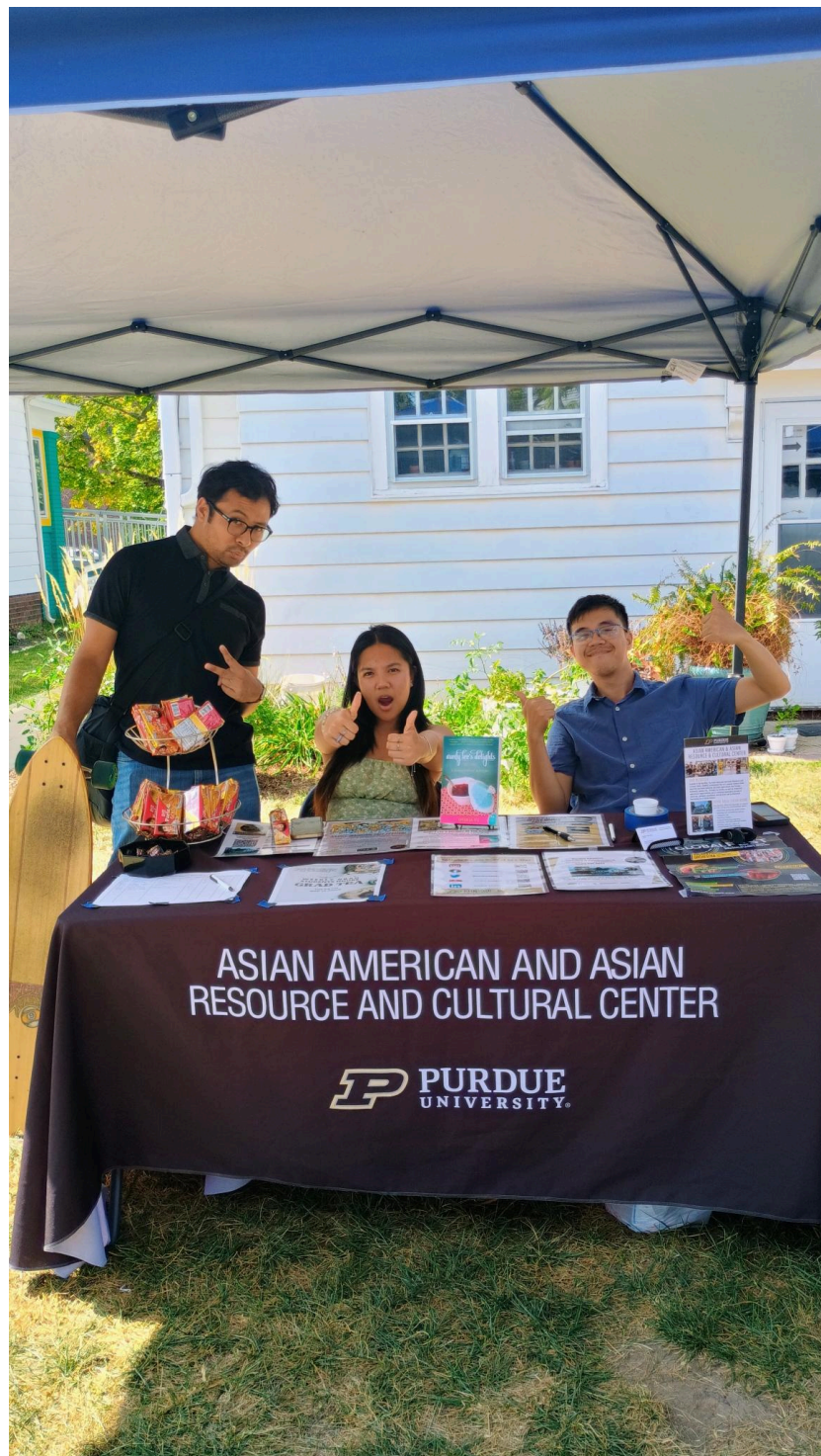
The AAARCC was one of the campus partners featured at Sigma Lambda Gamma's Multicultural Festival that took place on Friday, September 20, 2024.