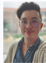
Theo Sorg LGBTQ Center

Virtual option available! Use QR or link: bit.ly/LunchLearnFall24